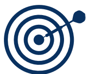
Focusing on your goals

Your approach to investment will vary depending on what you are looking to achieve.